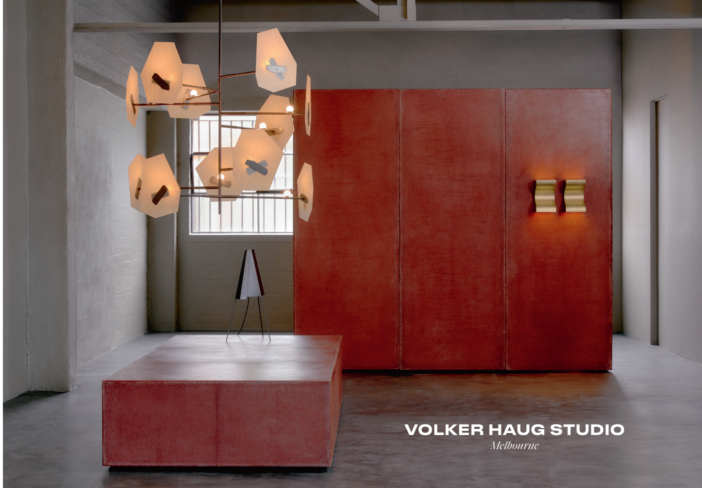
VOLKER HAUG STUDIO Melbourne